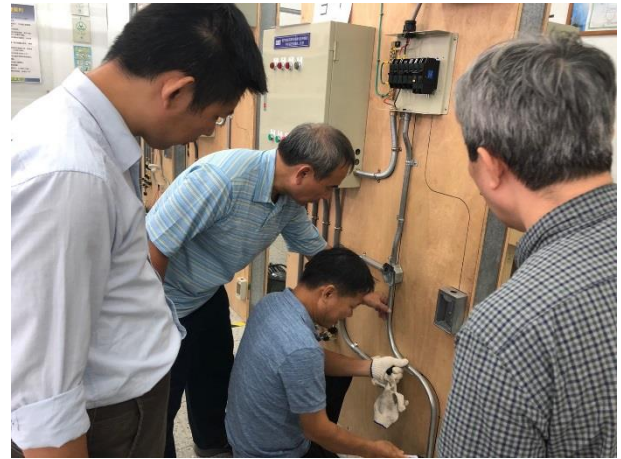
Fig.2 Teacher certificate study