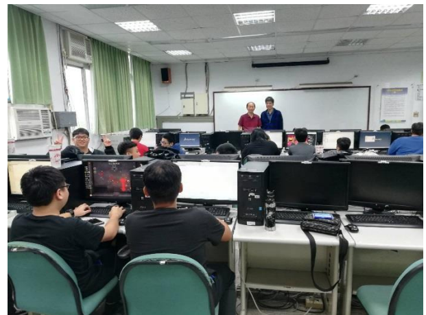
Fig. 4 Collaborative teaching