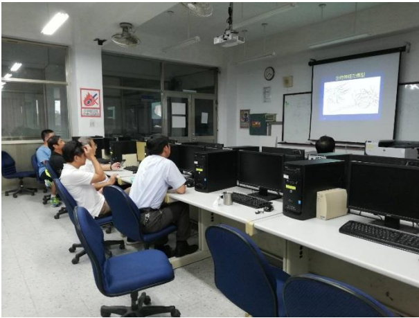
Fig. 1 Teacher community study

This sub-project has held two teacher community activities, two teacher certification seminars, one course implements teacher collaborative teaching and implements a teaching assistant system. The theme of the community activity is artificial intelligence and robots, which has improved teachers' relevant knowledge; the theme of teacher certification study is indoor water and electricity wiring, including cutting, expanding, bending, connecting, and threading PVC pipes, and cutting metal pipes. , Bending pipes and power distribution lines, etc.; the course for the implementation of collaborative teaching by teachers is "computer-aided design", and industry experts are introduced to teach together to strengthen teachers' practical teaching ability, improve the content of teaching materials, and develop innovative teaching methods to enhance the overall practical teaching quality .