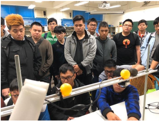
Fig. 1 Outside school visit

This project held an off-campus visit, two semesters of license counseling and a special topic for professional teacher guidance. Visited the Department of Mechanical and Electrical Engineering of Yilan University outside the school to visit the three characteristic achievements of green energy, geothermal power generation, and drones to increase students' knowledge in different fields; in terms of license guidance, use the existing excellent equipment to promote the mechanical and electrical integration of the Ministry of Labor. License counseling for Grade B and CNC milling machines. In the activity of professional teacher guidance topic, three manager-level industry teachers are invited to be lecturers to guide the topic together with the instructor, and introduce industry information and concepts to further enrich the quality of the topic and enhance students' innovative and creative ability.