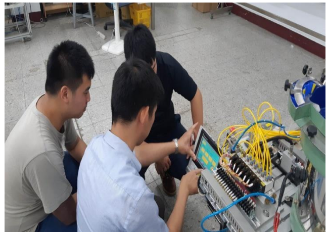
Fig. 2 License counseling