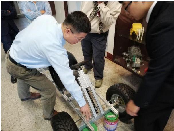
Fig. 3 Professional guidance topics